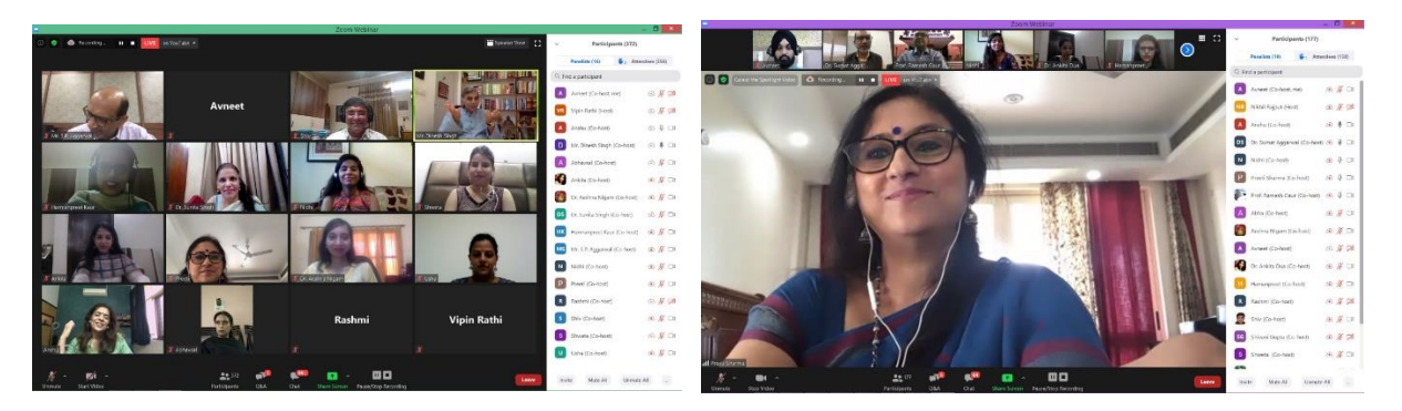
More than 1000 participants from all over the country registered and successfully completed the programme. The valedictory session was held on 25<sup>th</sup> August 2020. The chief guest for the event